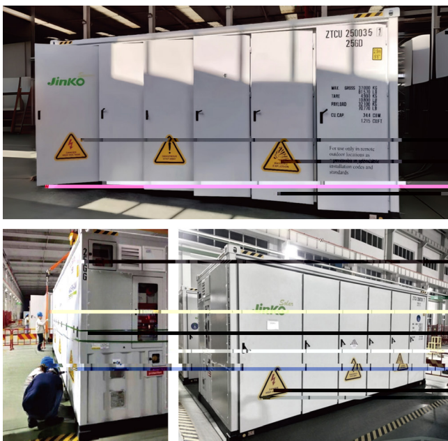
Figure 1: Project Photos

For the global energy storage system (ESS) market, JinkoSolar promotes UL, IEC, and regional-specific certified products such as battery cells, modules, packs, racks, and DC battery blocks. For the DC side market, JinkoSolar's most popular offerings are the fully integrated 20-foot DC battery container block solutions that come in 2 variants – the air-cooled version at 1.5MWh and the liquid-cooled version at 3.4 MWh.